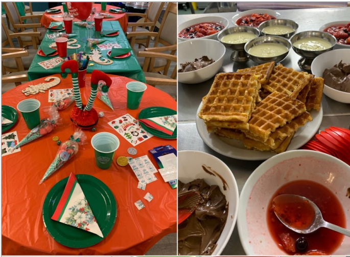
Everyone enjoyed waffles and pancakes with chocolate, white chocolate, fruit and cream