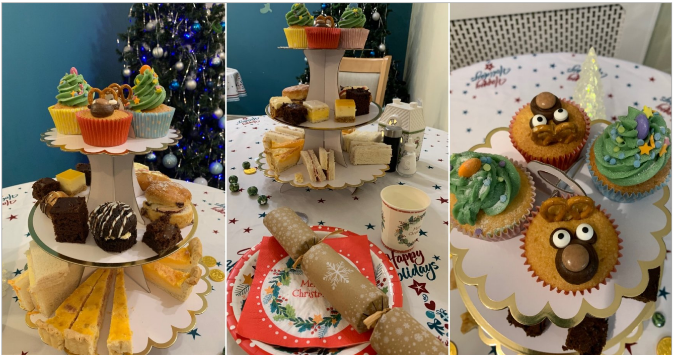
Christmas party food!!