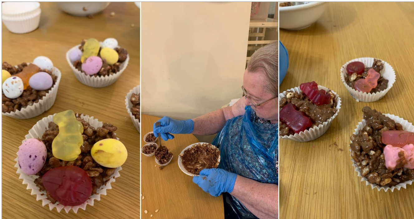
Perfect Rice Crispie Cakes for their supper later