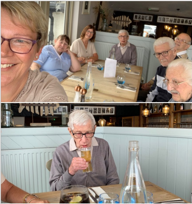
A few more pictures from our lunch trip x